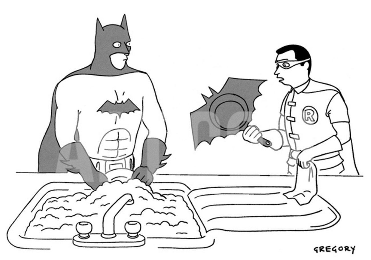
"Don't you think the saucepans are overkill?"